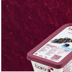
Ingredient: blackcurrant 100%