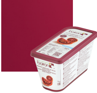
Ingredient: blood orange 100%